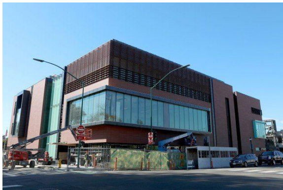
888 C Street and Heritage Plaza, Hayward ,CA